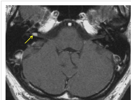
Transversal T1-weighted MRI after contrast: small acoustic neuroma